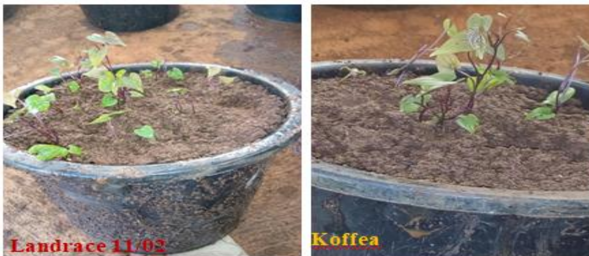
Figure 3. Acclimatized plantlets of two yam landraces after one month in greenhouse